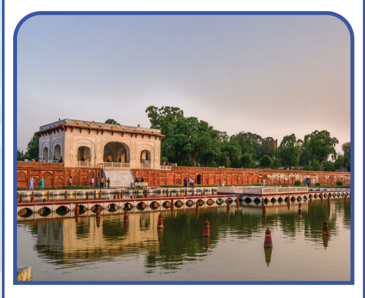
Step into the serene beauty of Shalimar Garden, a masterpiece of Mughal landscape design. Experience tranquility and history intertwined

https://maps.app.goo.gl/tMZbxxUJwa6LYKQa8