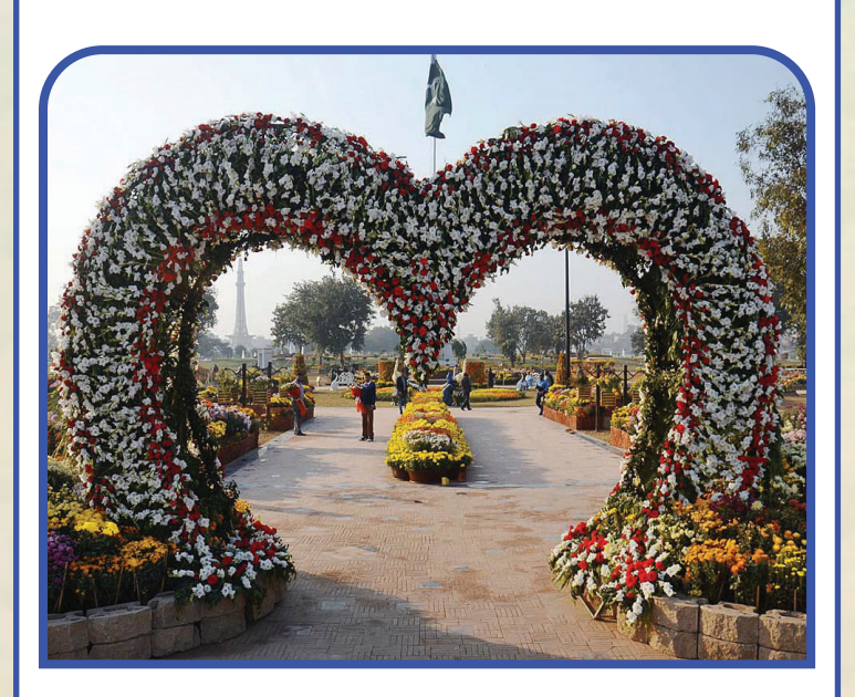
Explore the historic charm of Iqbal Park, a tribute to Pakistan's national poet. A green oasis in the heart of Lahore

nttps://maps.app.goo.gl/mdF4a12NvwMqf7SM6